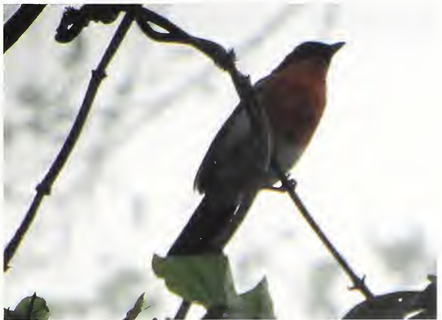
Figure 2. The bright orange breast of Braun's Bushshrike Laniarius brauni distinguishes it from the chestnut-breasted Luehder's Bushshrike L. luehderi (Nik Borrow)

The only previous range size estimate is of an Extent of Occurrence of 4,600 km 2 (BirdLife International 2000, 2008). Using the updated information presented herein, we suggest by the same definition a range of c. 3,500 km 2 , smaller than that estimated by BirdLife International (2008) because we reject the possible record from